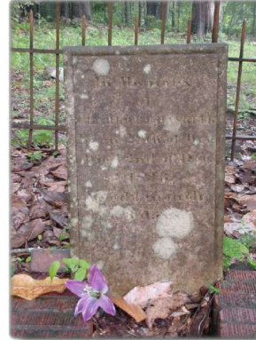
Trinity Episcopal Church - 4 -