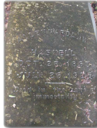
- 2 - Abbeville, South Carolina